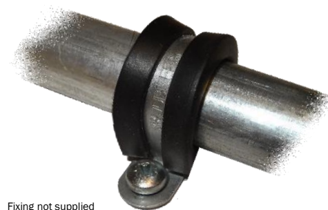
Fixing not supplied